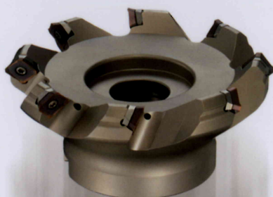
WGX F TYPE